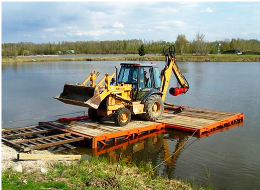
Mighty Modular Barge