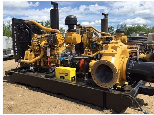
High Head Trash Series Mighty Pumps