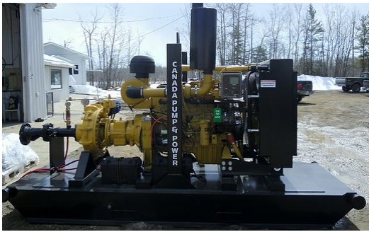
High Head Water Series Mighty Pumps