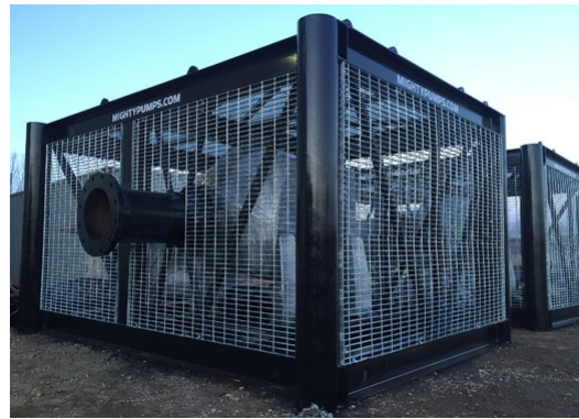
Autonomous Submersible Mighty Pumps