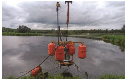
Autonomous Mighty Dredge

Canada Pump and Power, 53113 Range Road 211, ARDROSSAN, AB T8G 2C5, Canada, 7809221178