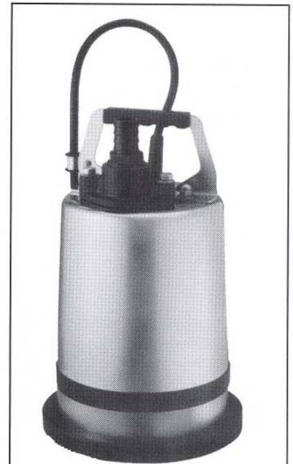
SL-75 with 1" hose fitting