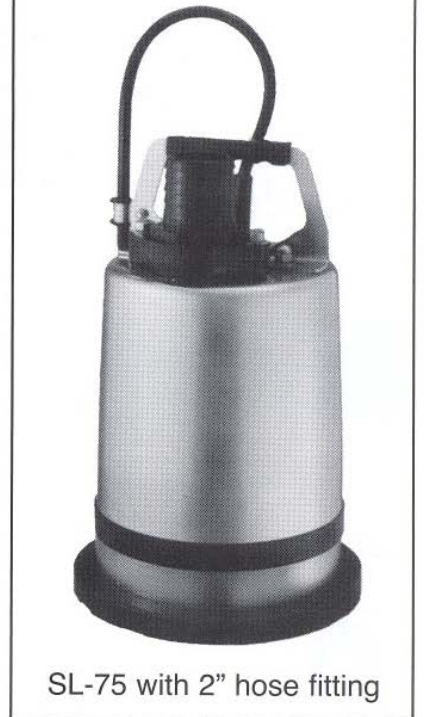
SL-75 with 2" hose fitting