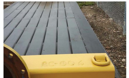
Fluid Road Crossings