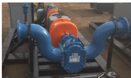
Rotary Lobe Froth Pumps