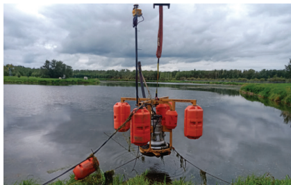
Autonomus Mighty Dredge