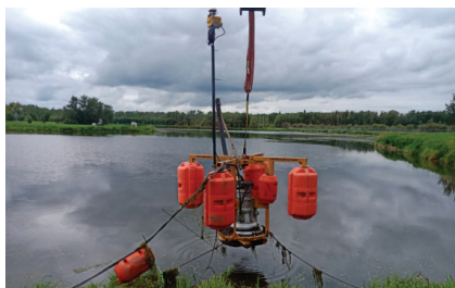
Autonomous Mighty Dredge