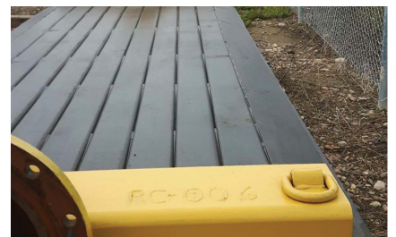
Fluid Road Crossings