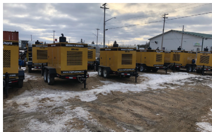
Dewatering Trash Series Mighty Pumps