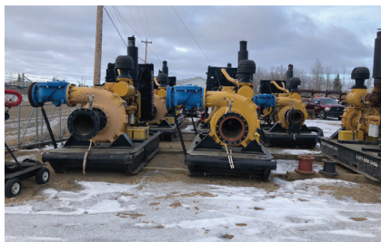
High Head Trash Series Mighty Pumps