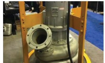
Submersible Electric Pumps