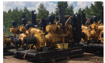
High Head Water Series Mighty Pumps