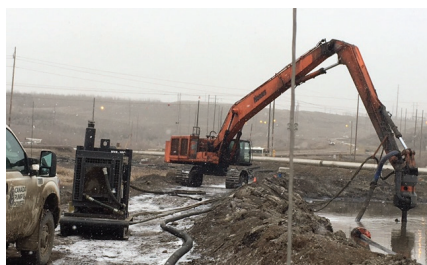
Long Reach Excavators