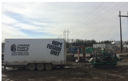
HDPE Fusion Equipment and Training