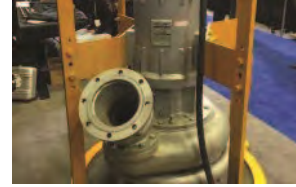
Submersible Electric Pumps