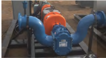
Rotary Lobe Pumps