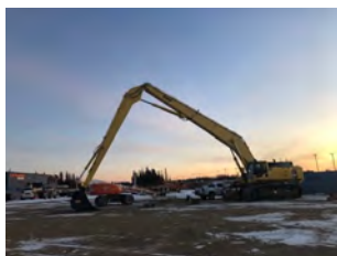
Long Reach Excavators