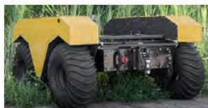
Mighty Duck ROV