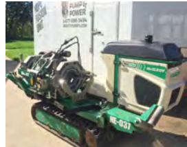
HDPE Fusion Equipment and Training