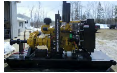
High Head Water Series Mighty Pumps