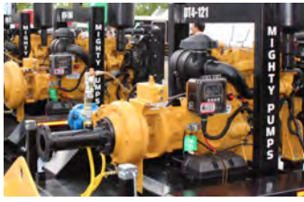
Dewatering Trash Series Mighty Pump