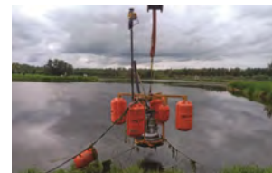
Autonomous Mighty Dredge