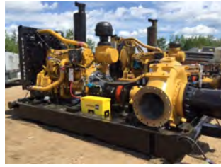
High Head Trash Series Mighty Pumps