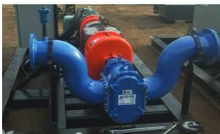
Rotary Lobe Pumps