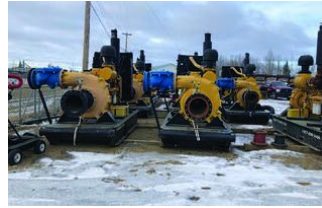
High Head Trash Series Mighty Pumps