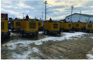
Dewatering Trash Series Mighty Pumps