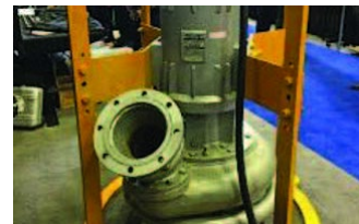
Submersible Electric Pumps