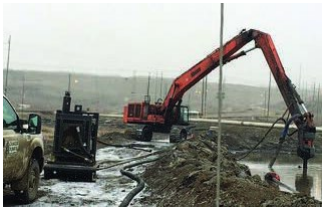
Long Reach Excavators