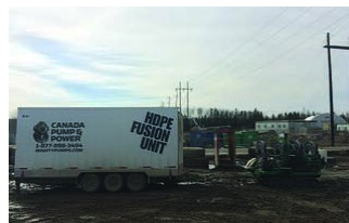
HDPE Fusion Equipment and Training