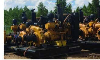
High Head Water Series Mighty Pumps