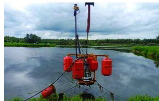
Autonomous Mighty Dredge