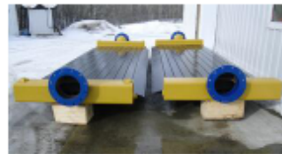
Fluid Road Crossings