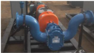
Rotary Lobe Pumps