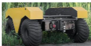
Mighty Duck ROV