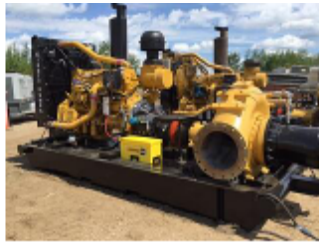
High Head Trash Series Mighty Pumps