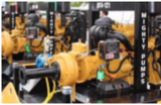
Dewatering Trash Series Mighty Pump