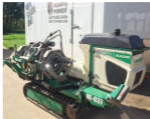
HDPE Fusion Equipment and Training