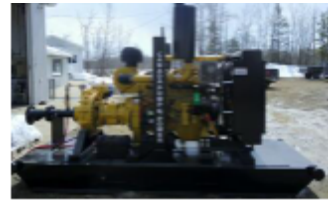
High Head Water Series Mighty Pumps