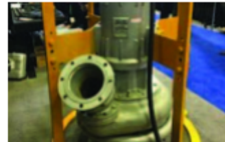
Submersible Electric Pumps