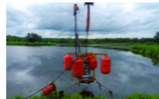
Autonomous Mighty Dredge