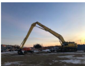
Long Reach Excavators