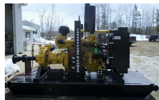
High Head Water Series Mighty Pumps