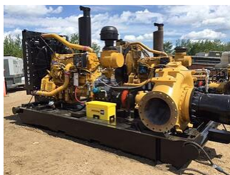
High Head Trash Series Mighty Pumps