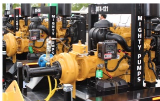
Dewatering Trash Series Mighty Pumps