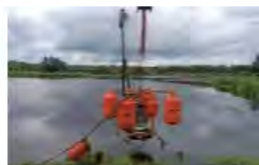
Autonomous Mighty Dredge