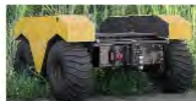
Mighty Duck ROV