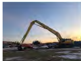
Long Reach Excavators