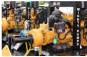
Dewatering Trash Series Mighty Pump