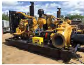
High Head Trash Series Mighty Pumps