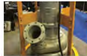
Submersible Electric Pumps