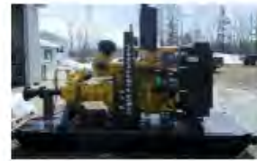
High Head Water Series Mighty Pumps