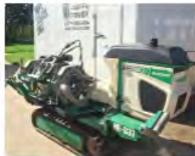
HDPE Fusion Equipment and Training