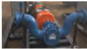
Rotary Lobe Pumps