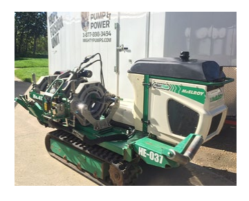
HDPE Fusion Equipment and Training