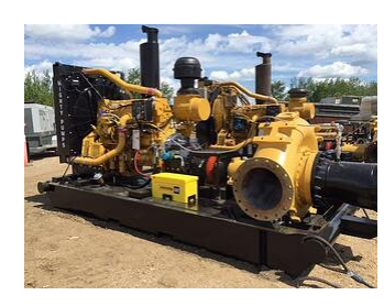
High Head Trash Series Mighty Pumps