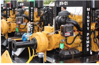
Dewatering Trash Series Mighty Pump