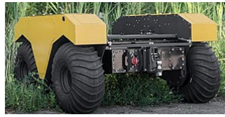
Mighty Duck ROV