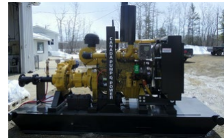
High Head Water Series Mighty Pumps