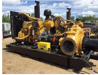
High Head Trash Series Mighty Pumps