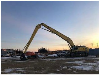
Long Reach Excavators