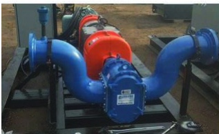
Rotary Lobe Pumps