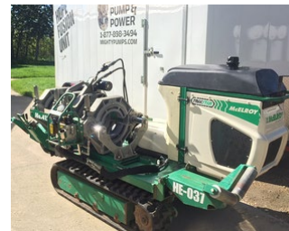
HDPE Fusion Equipment and Training