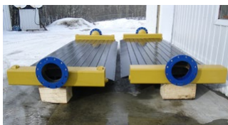
Fluid Road Crossings