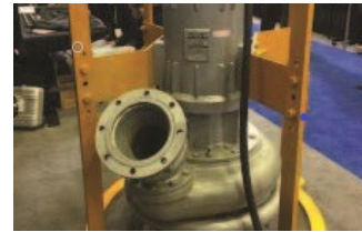
Submersible Electric Pumps