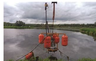
Autonomous Mighty Dredge