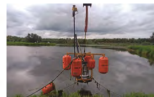
Autonomous Mighty Dredge