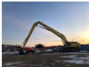
Long Reach Excavators