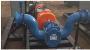
Rotary Lobe Pumps