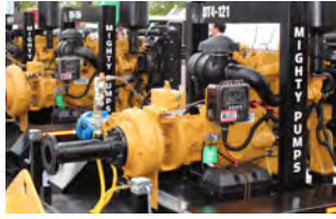
Dewatering Trash Series Mighty Pump