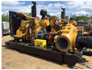
High Head Trash Series Mighty Pumps