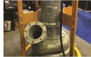
Submersible Electric Pumps