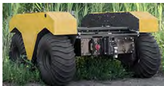
Mighty Duck ROV