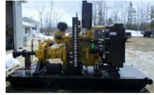
High Head Water Series Mighty Pumps