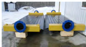
Fluid Road Crossings