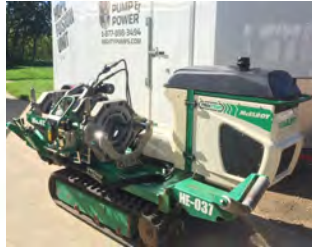
HDPE Fusion Equipment and